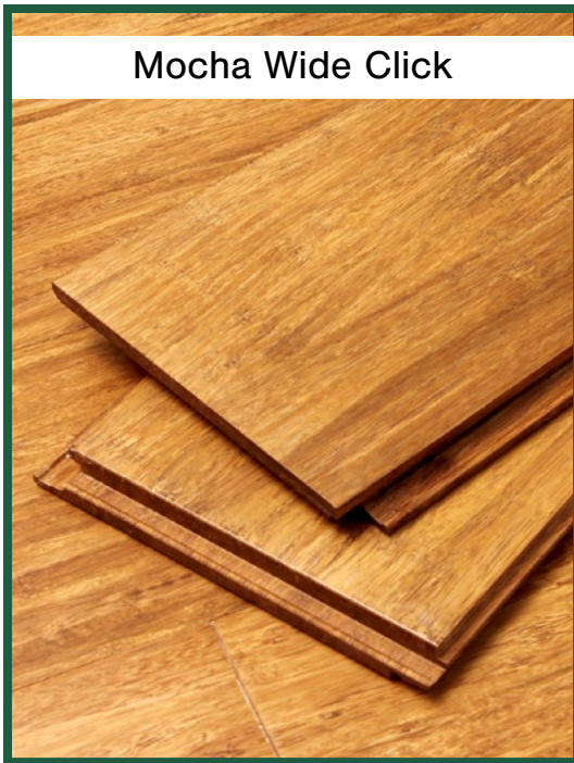
Mocha Wide Click