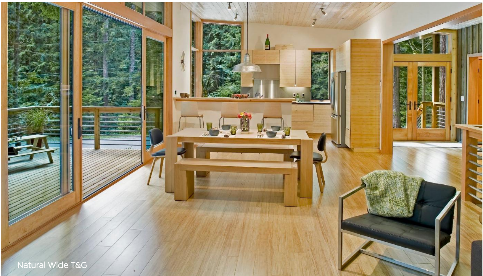
Natural Wide T&G