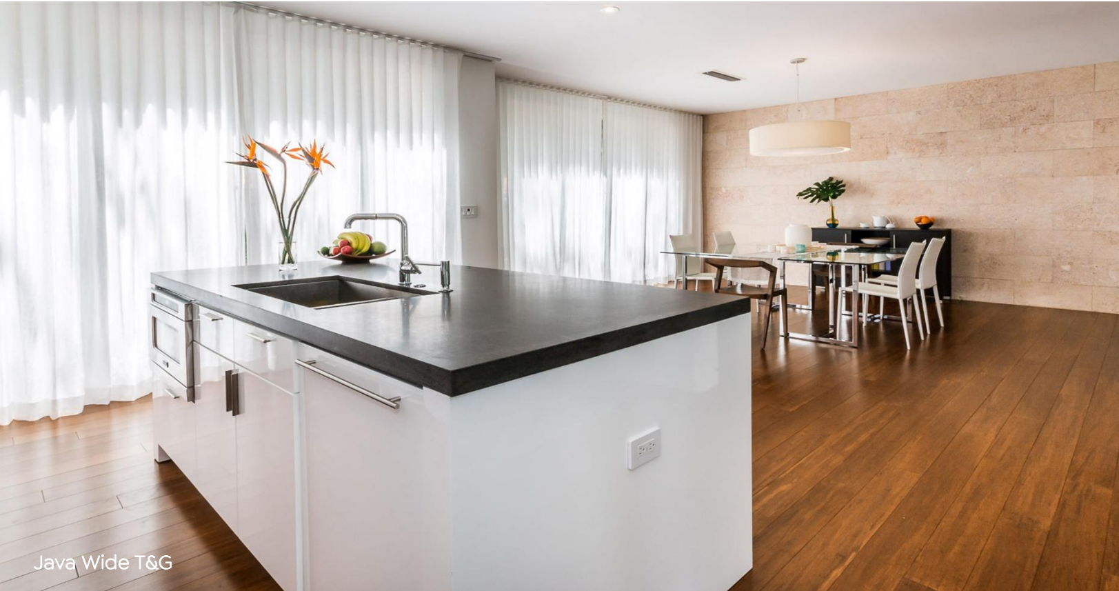
Java Wide T&G