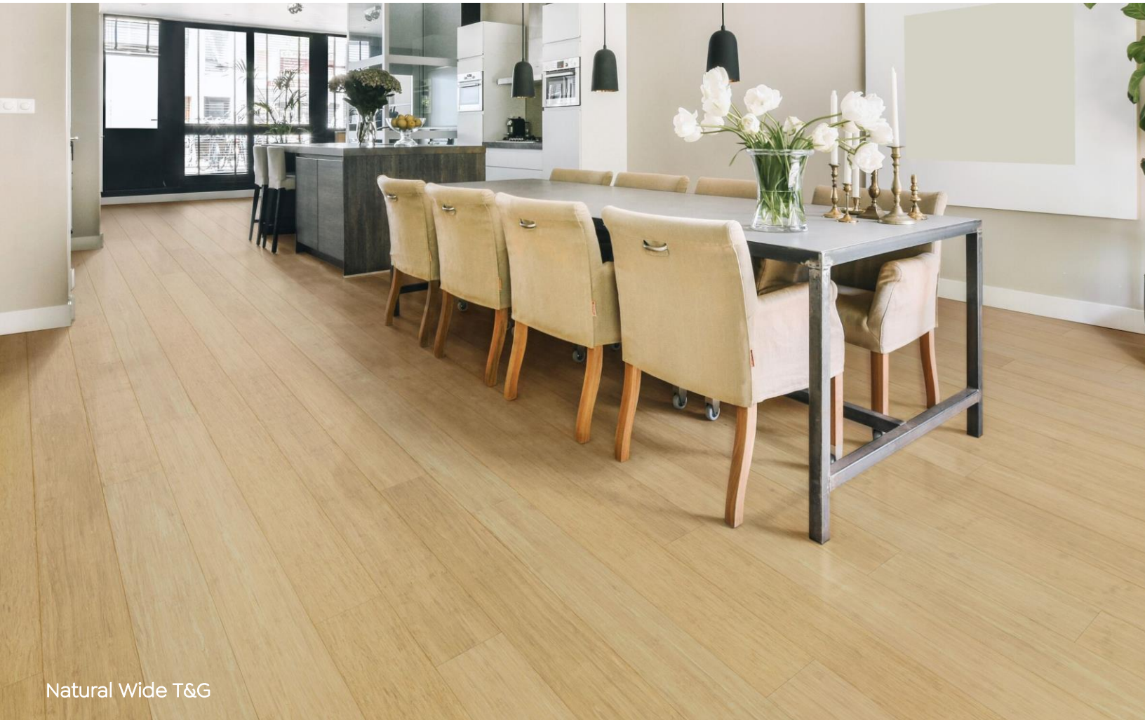
Natural Wide T&G